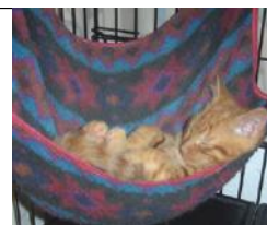
This could be you after your massage session!

For the massage connoisseur this is a fabulous deal. You can feel good both from the massage and knowing that you have directly helped to provide necessary medical care for 20 homeless shelter cats.