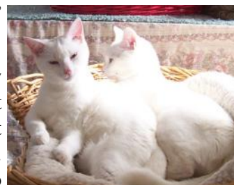
Wintergreen and Teaberry try out a new bed

We would love to stay in our new home and to continue operating Project Cat from this paradise. But we cannot continue on in a temporary shelter. We must find the ways and means to obtain a permanent place of our own.