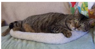
Sam takes a break from the stresses of the day

Yes, the cats all look comfy and happy in their new digs, but that doesn't mean they don't need homes, because they cannot stay here forever! Calls come in every day asking us to take in stray cats or owned cats that people can no longer keep or no longer want. So that we can keep helping people and cats, we must move the resident cats out to permanent homes. For every cat in the shelter there are at least ten more waiting to come in.