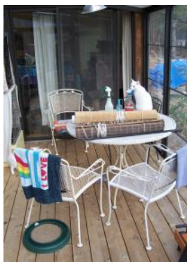
They all take turns using the sunroom