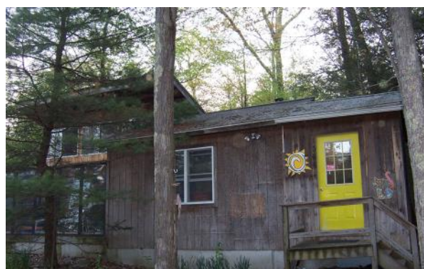
Project Cat's new home