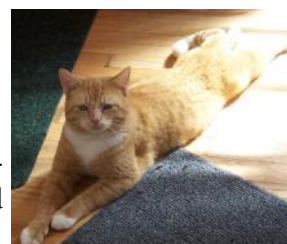
Arnie enjoys his new "digs" ....and yes, he found a home of his own!